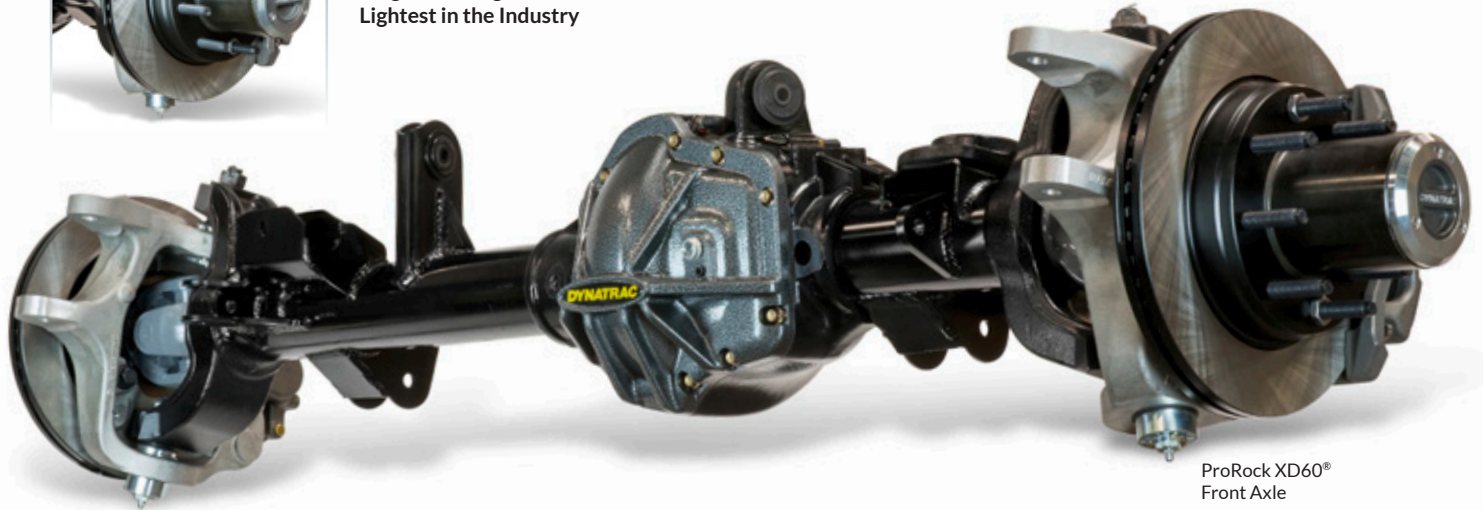
ProRock XD60® Front Axle

Exclusive 1550LT® Wheel Ends are the Largest, Strongest and Lightest in the Industry