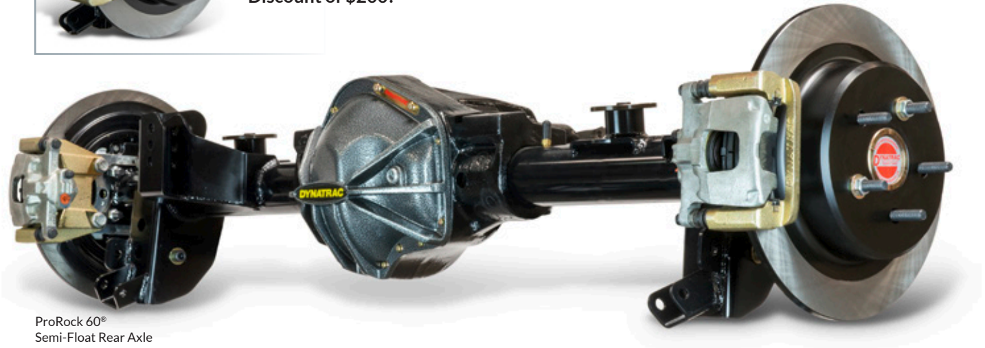
ProRock 60® Semi-Float Rear Axle