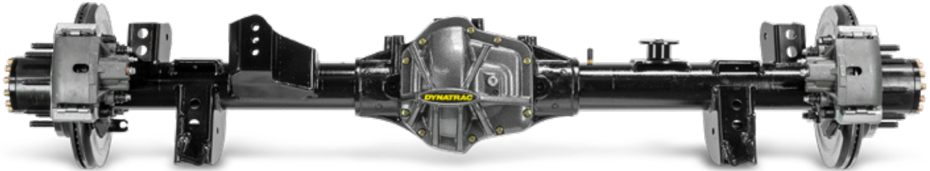
ProRock XD60® Full-Floating Rear Axle