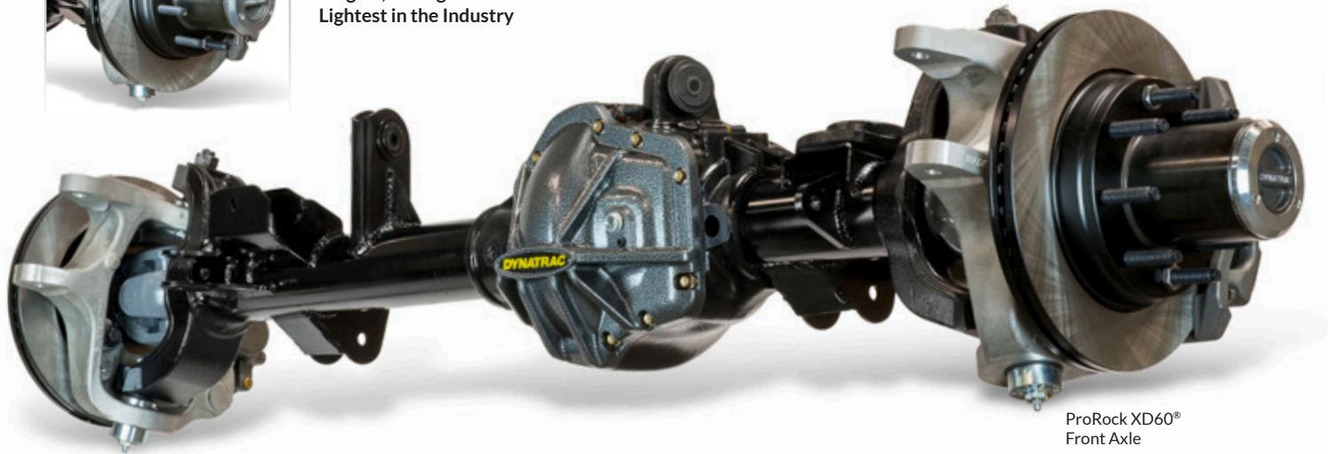
ProRock XD60® Front Axle

Exclusive 1550LT® Wheel Ends are the Largest, Strongest and Lightest in the Industry