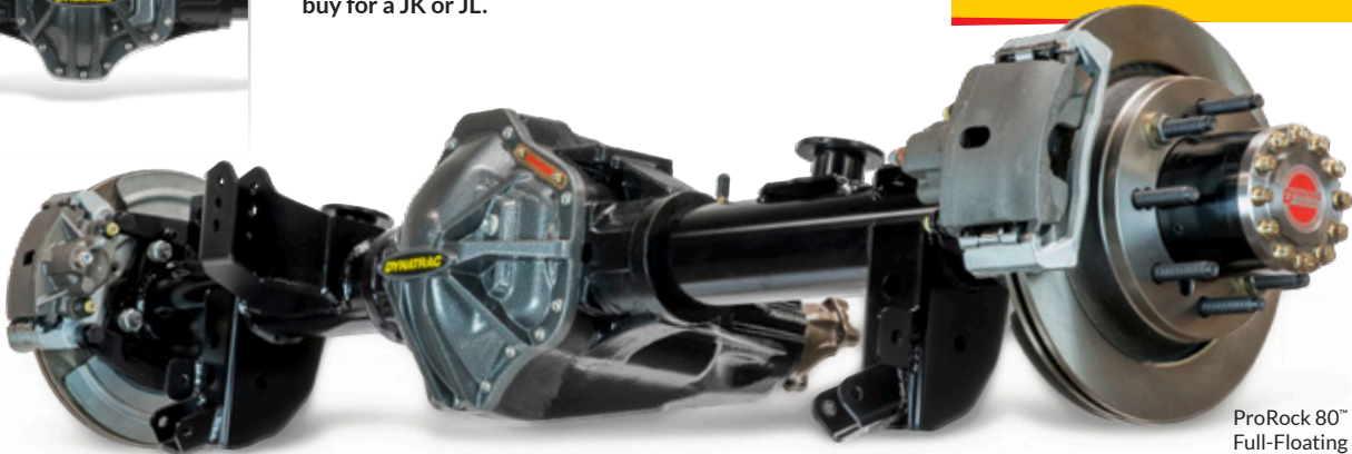
ProRock 80™ Full-Floating Rear Axle