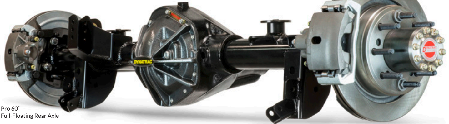
Pro 60™ Full-Floating Rear Axle