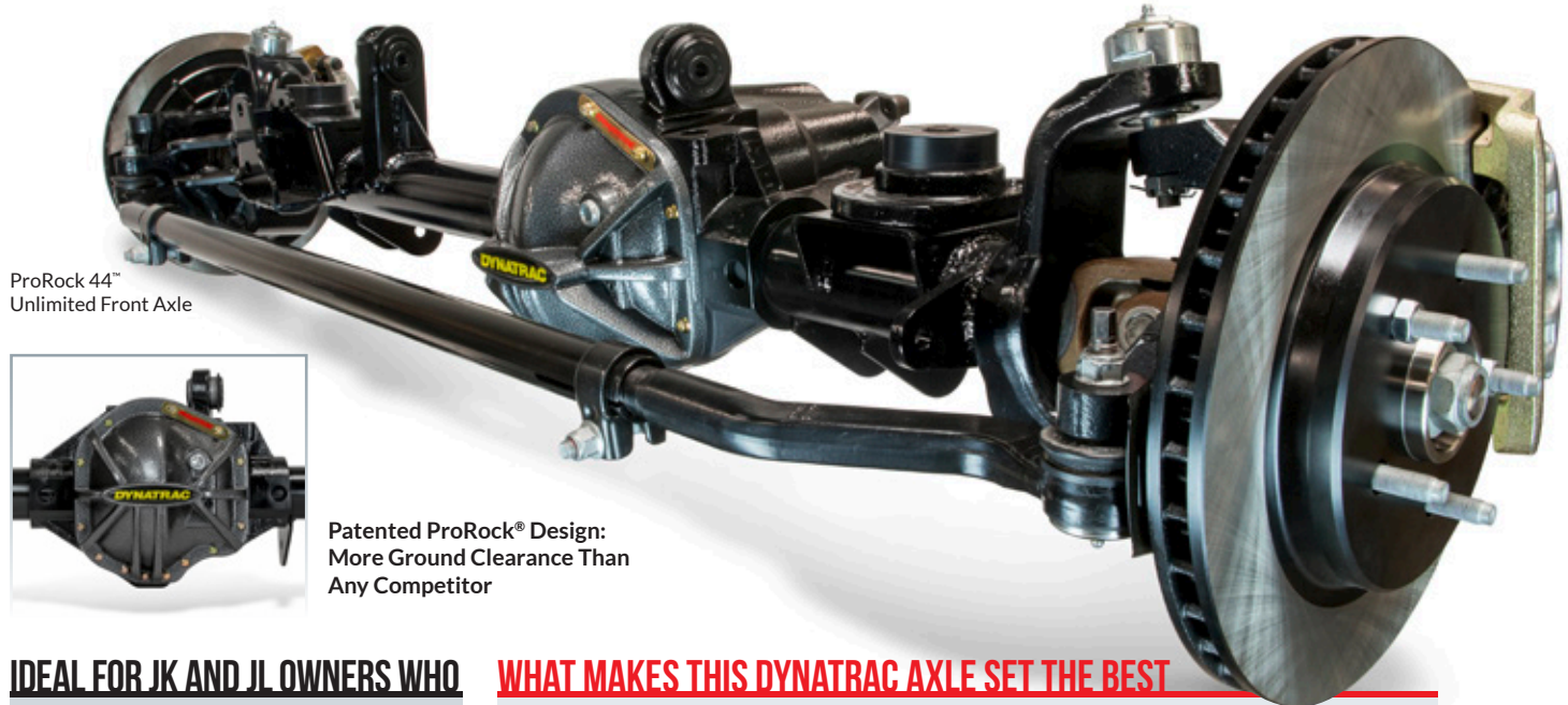
ProRock 44™ Unlimited Front Axle

Patented ProRock® Design: More Ground Clearance Than Any Competitor