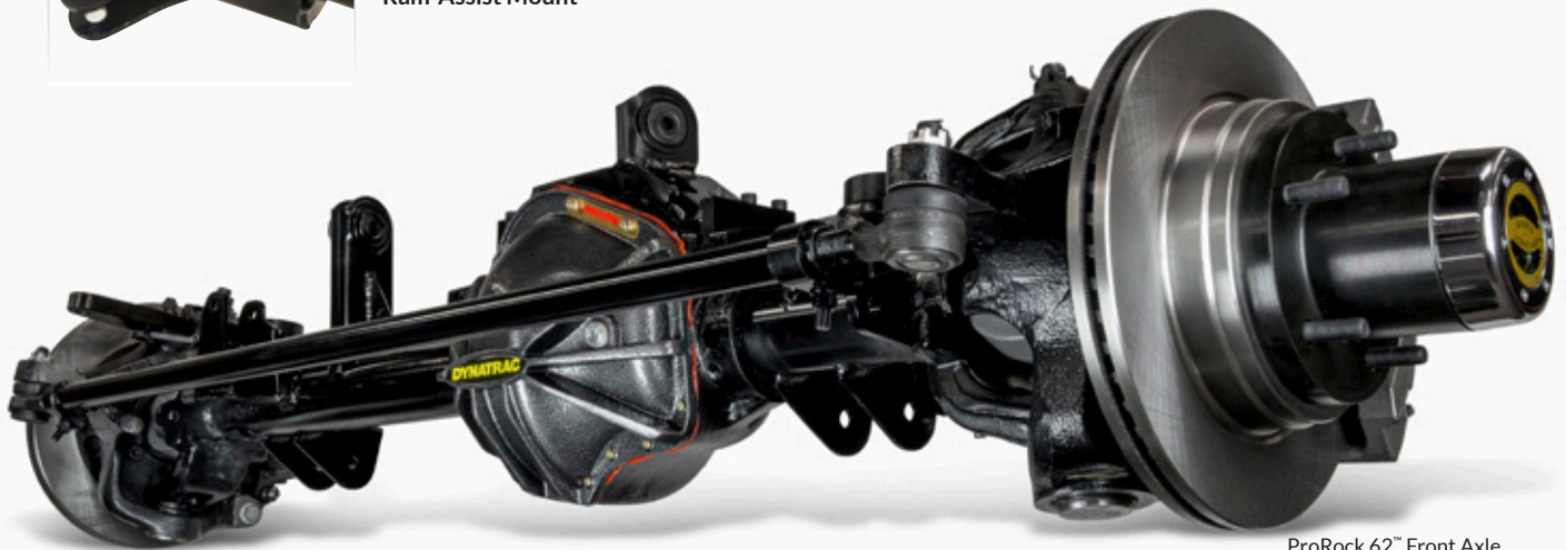
ProRock 62™ Front Axle (Note: ProRock 60® is shown)