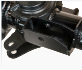
Front Axle Features Exclusive Raised Track-Bar Bracket with integrated Ram-Assist Mount